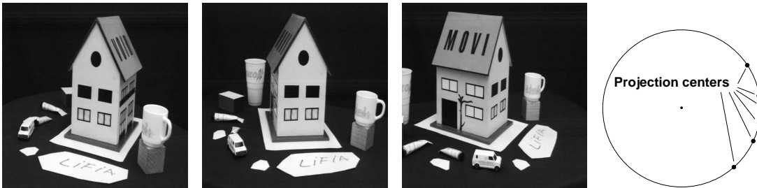
Figure 2. Example of a critical image sequence. The images are obtained while rotating about the same axis. (a)-(c) Three images of the 6-image sequence. A self-calibration was done from point correspondences of the images [21]. As expected, the result is not a Euclidean structure of the scene, since for example the estimated aspect ratio is about 2, while the true one is about 1.5. However, the recovered motion sequence is, as the original one, an orbital motion, i.e. it consists of rotations about a fixed axis. This is illustrated in (d) where a top view of the recovered projection centers shows that they lie very close to a circle.

Thus, identifying the potential absolute conics of S' is equivalent to identifying those of S and thus to determining all ambiguous Euclidean reconstructions from the sequence S ! In the following subsection we discuss how to determine the potential absolute conics of a rigid motion sequence.